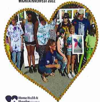
Home Health & Hospice of Kansas