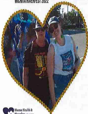
Home Health & Hospice of Kansas