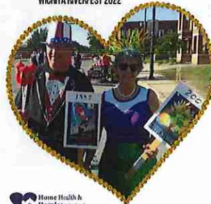
Home Health & Hospice of Kansas