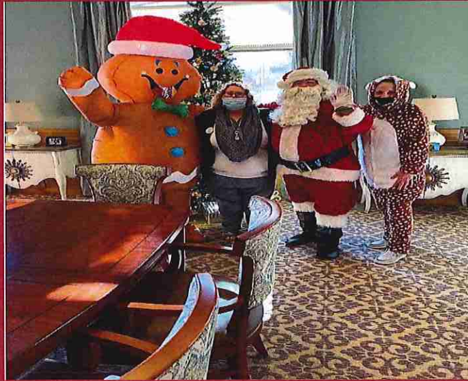
Believe in the Magic of the Holiday