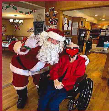
Merry everything and happy always