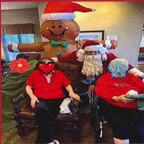
'Tis The Season to Sparkle