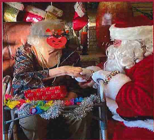
May you never be too grown to search the skies on Christmas Eve